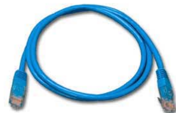
EX 1-211 BL CAT5E-1M PC