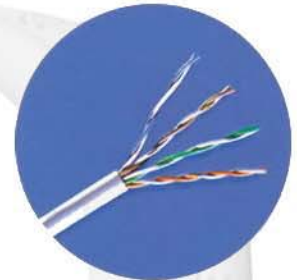
EX 1-111 GY CAT5E UTP